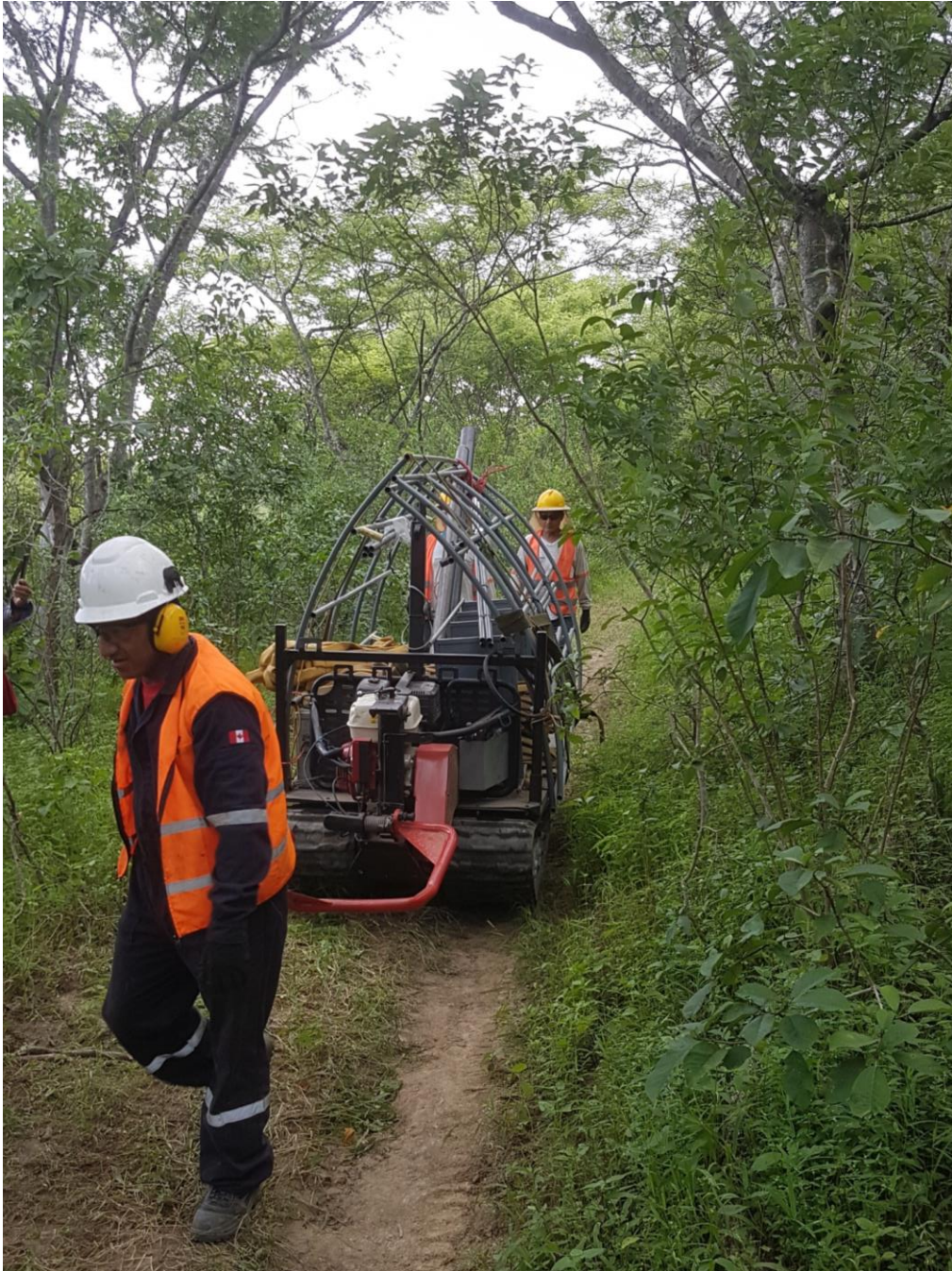
Photo 1: transporting the drill rig to site using motorized trolleys along existing tracks